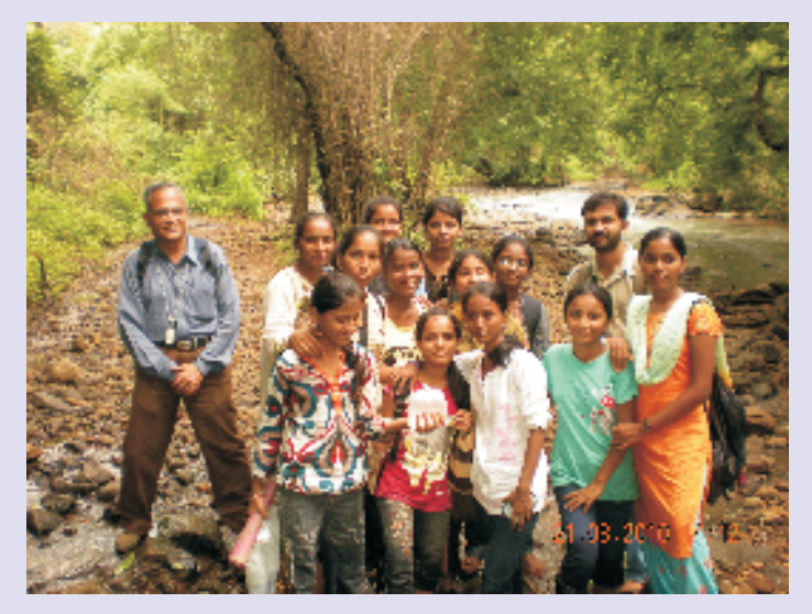
City walk - Educational tour - Trail at National Park - organized by Mumbai Univeristy