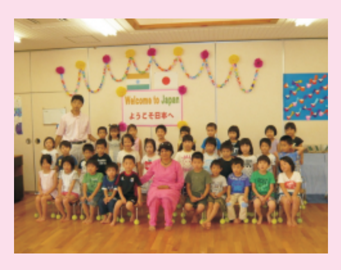
Kindergarten children of Elementary School at Amakusa (Kumamoto)

Apne Aap Women's Collective : 1st Lane Khetwadi, 1st floor Municipal School, Near Alankar Cinema, Mumbai-400 004. Phone: 022-23819721 • Email; <a href="mailto:apneaap@gmail.com">apneaap@gmail.com</a> Website; www.apneaap.info