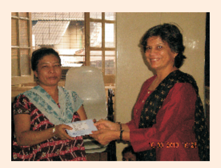
PAN Card distribution