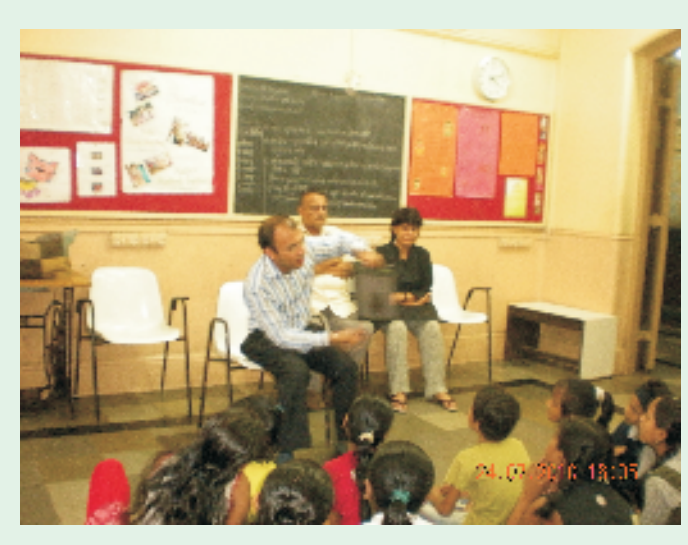
Eye specialist Lecture