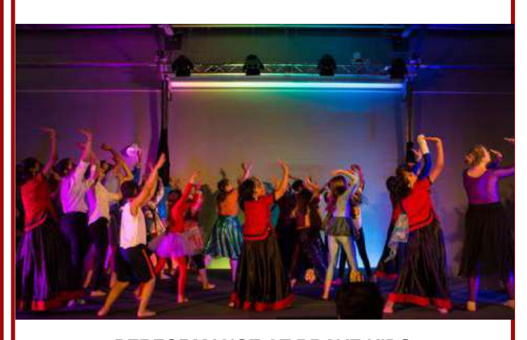
PERFORMANCE AT BRAVE KIDS FESTIVAL.