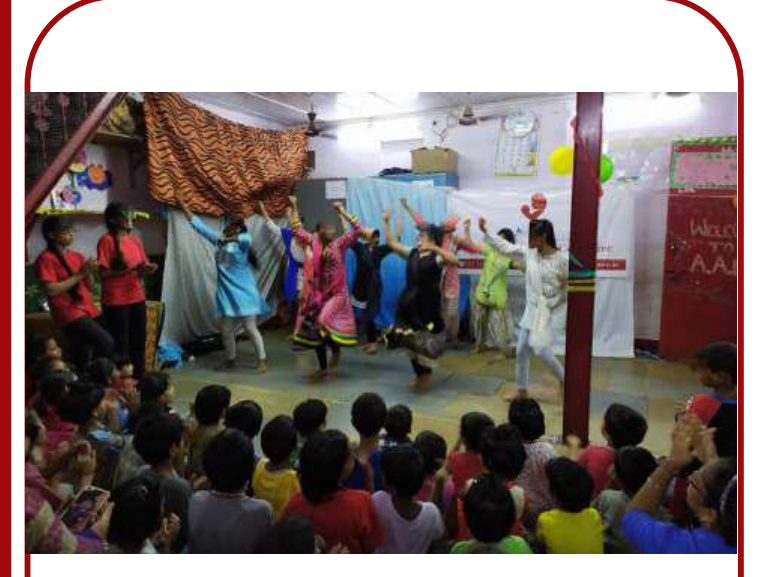
FELICITATION PROGRAMME FOR UDAAN BENEFICIARIES