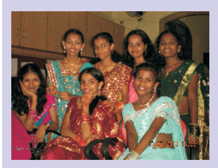
(This world is ours too - 10th standard girls Picture)