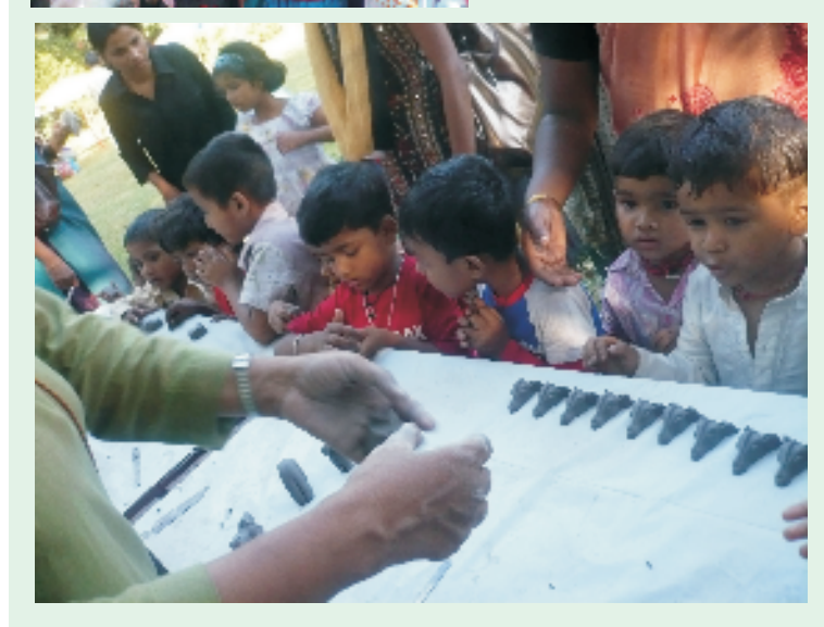
(Children enjoying a clay modelling workshop)