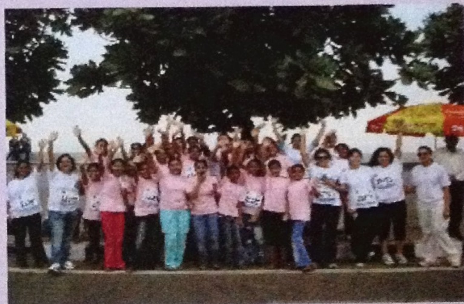
Some of the friends, well-wishers, trustees, staff and beneficiaries participated in SCMM Marathon.

Nutritional supplements like vitamin C (fresh lemon juice), beetroot, and milk have been added to the regular meals for the children.