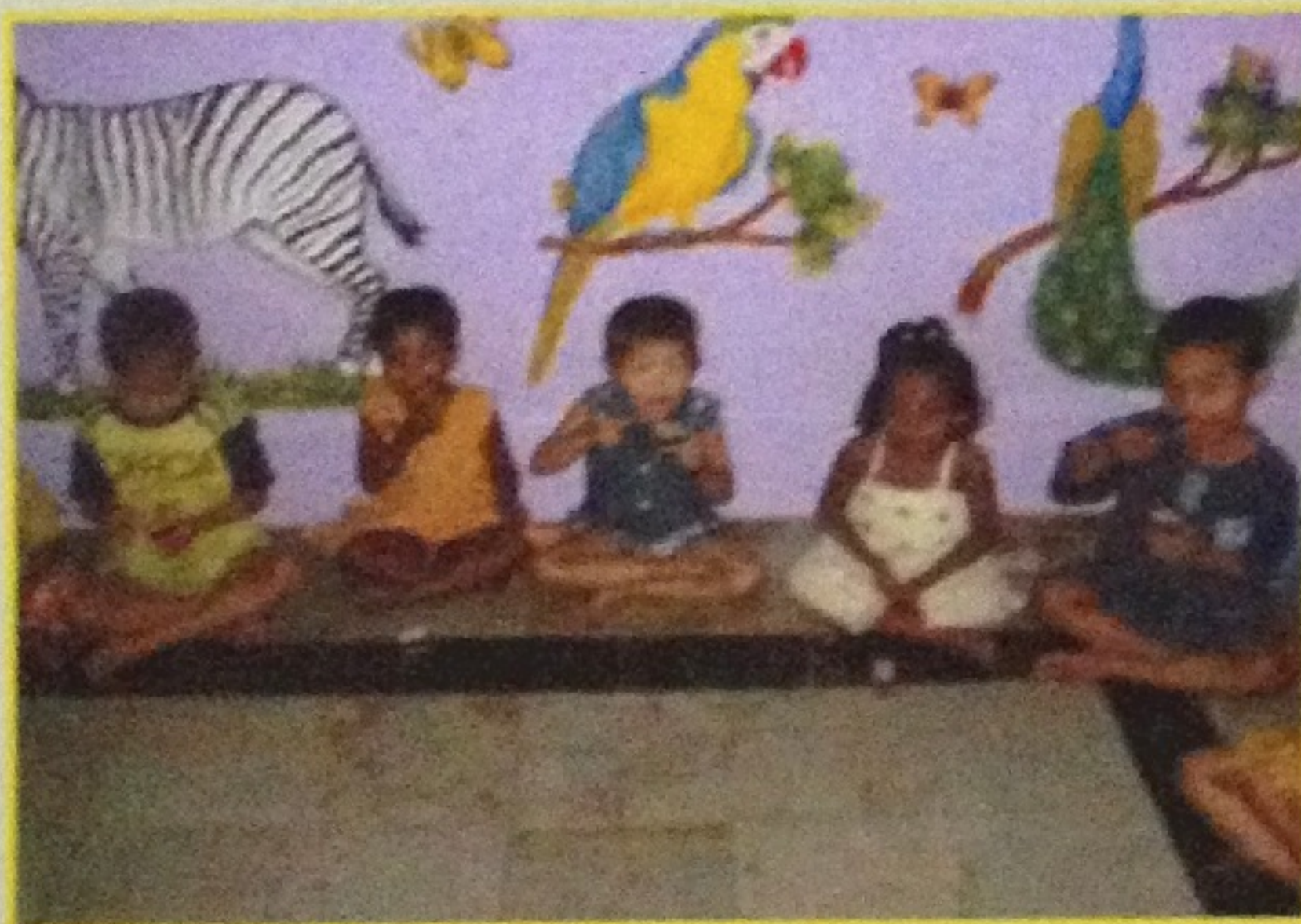
Kindergarten children enjoying cake on birthday celebration of a staff.

General Medical Camp was arranged, 18 Balwadi children attended this. A few children were in excellent health. The other children had minor problems like cold, ear infection, bad teeth etc.