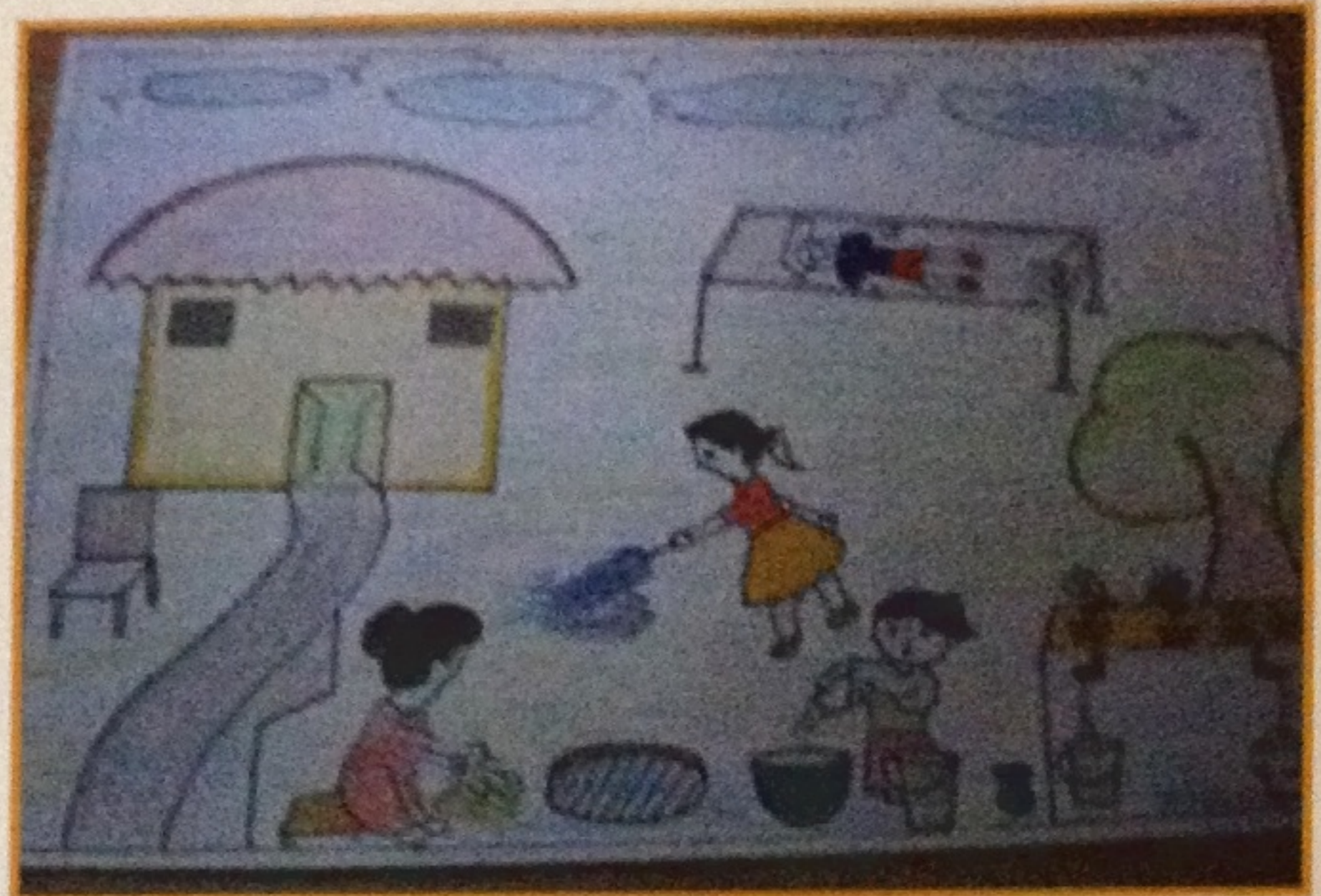
Sketch by a sparrow about their surroundings and environment.