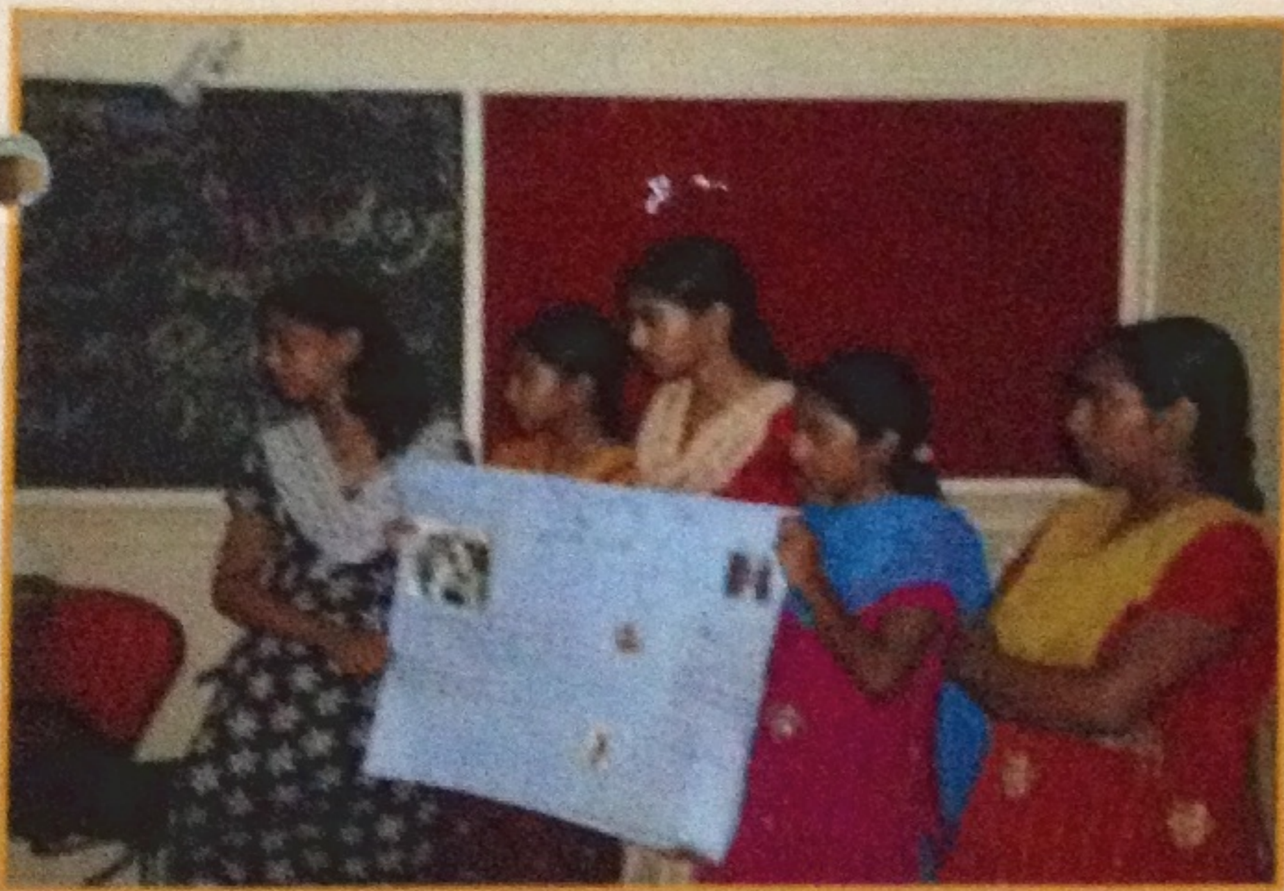
Girl's giving presentation of special sessions conducted for them in summer vacation.

2 girls have been referred for commerce coaching classes for grade 12. 1 girl has been referred for science coaching classes for grade 12. 1 girl has been referred for a job skills training program