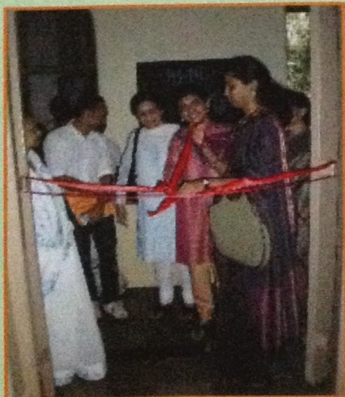
Organisation's newly renovated room's inauguration by Mrs. Supriya Sule.