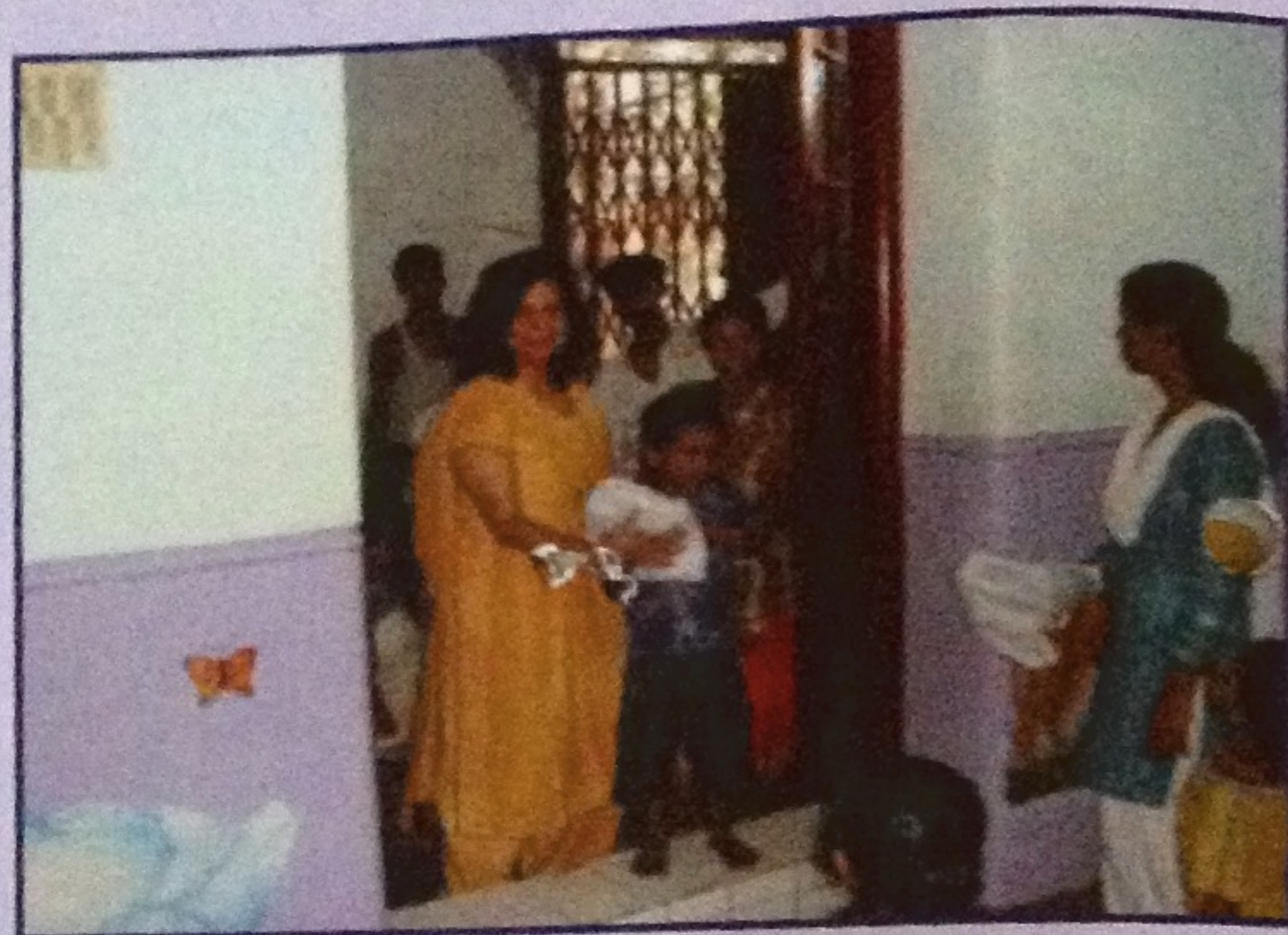
Special gifts to mothers for children on Christmas.